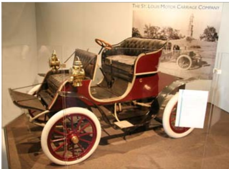
1903 St. Louis