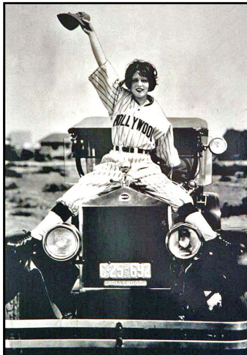
Actress Clara Bow posing on a 1919 Moon

There were more cars and trucks to see than the six I've pictured and many well prepared displays. If you missed our chapter's event, you have until April 1st to see this fine exhibit.