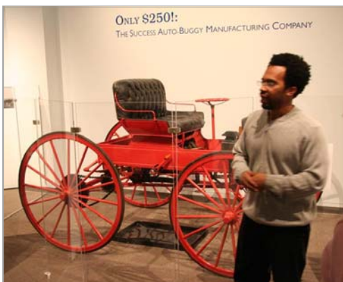
Our Docent and a 1906 Success