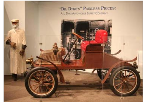
1902 Dyke kit car