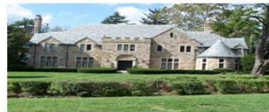
F.A. Bower House