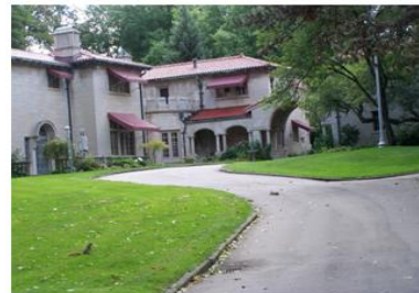
E.T. Strong House

Tickets: Available on Home tour day at the Bower House, 2630 Parkside Drive, $20.00 per person