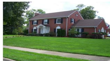
Harlow Curtice House