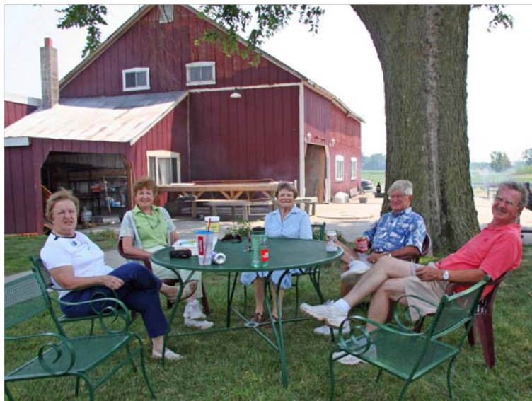
while others tended the shade.