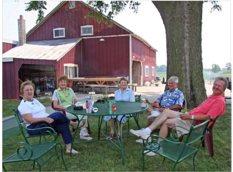
while others tended the shade.