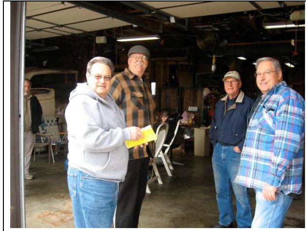
OK, Whose Car Is Next?