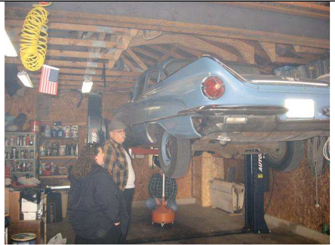
Blue Fin Gets An Oil Change