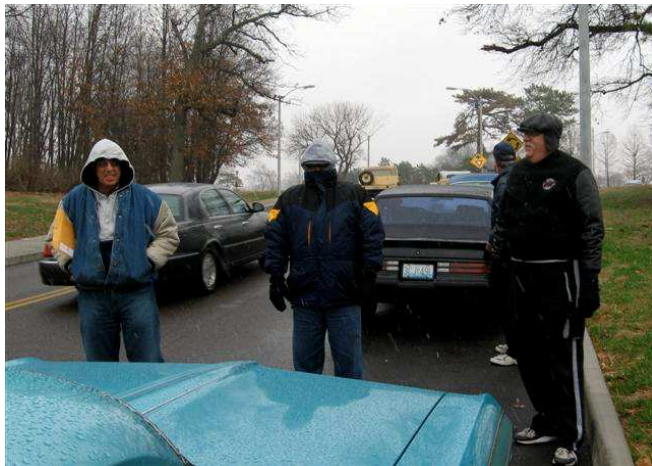
Do These Guys Look Cold?

Later on, the wind picked up, blew out the heater and threatened to blow the plastic sides away. When it seemed the canopy would be blown away, we gave in and disassembled our refuge from the cold and snow. Turnout other than by our Club was quite low.