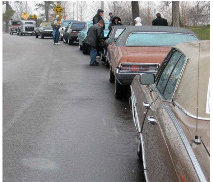
Buicks Lined Up Before Entering The Showfield