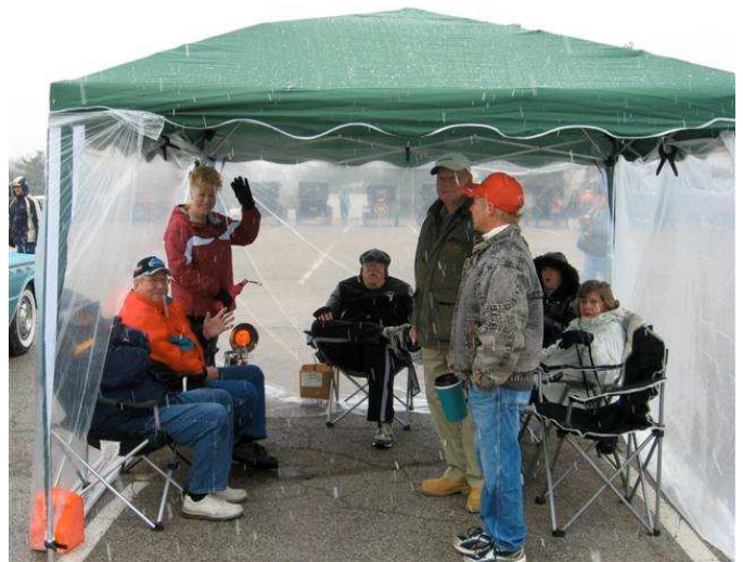
It Was Great Until The Wind Got Too Strong