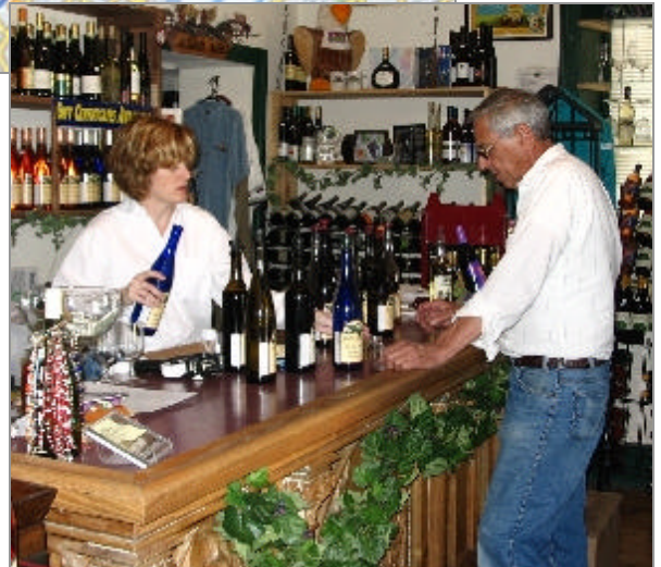
Grazing and visiting at the winery