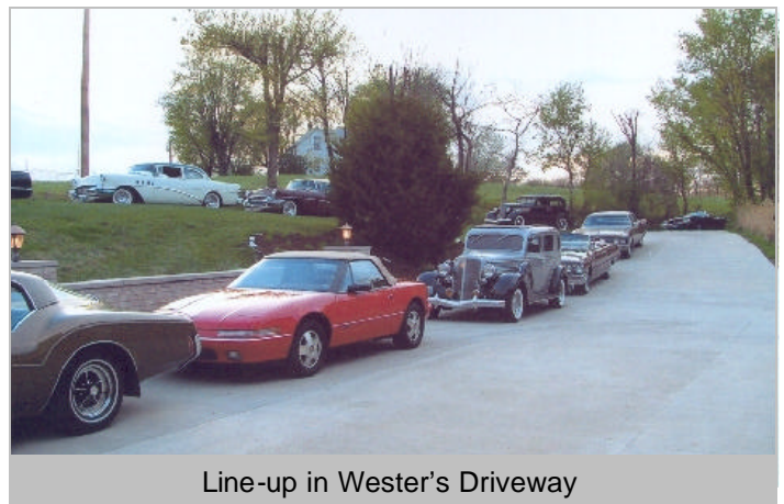
Line-up in Wester's Driveway