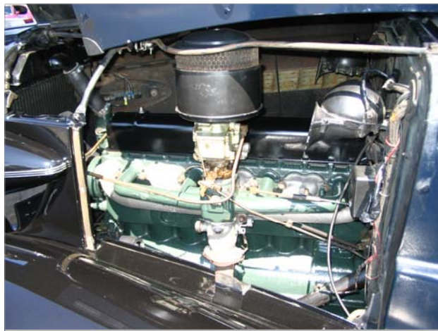
Jim Poole's recently rebuilt engine 1937 Buick