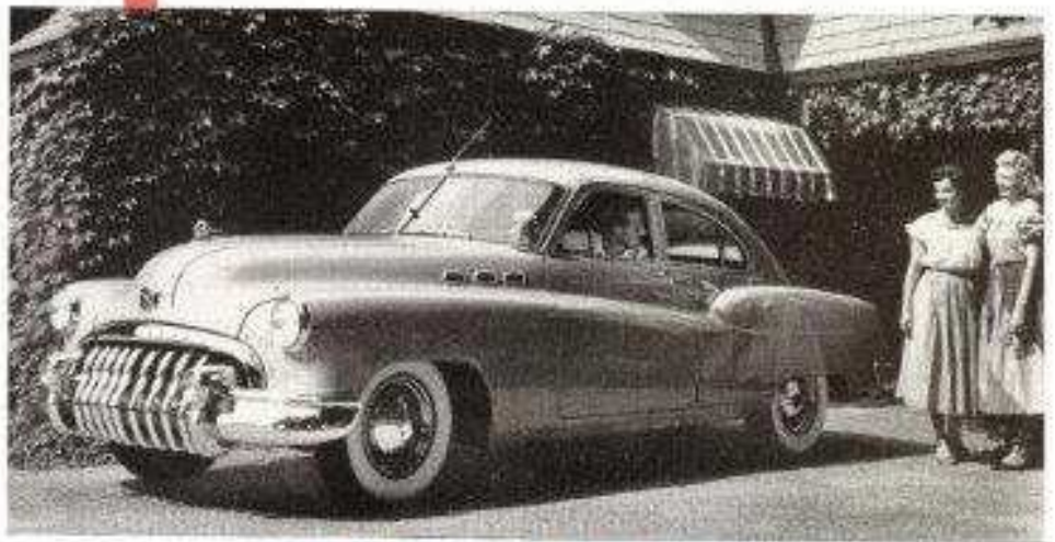
NEW BUICK SPECIAL