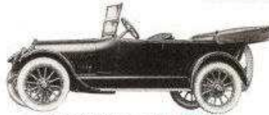
BUICK, Model 45, 1919