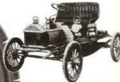
BUICK, Model B, 1904