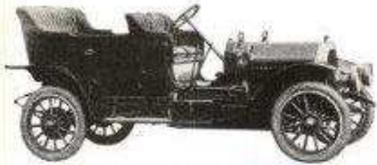
BUICK, Model 17, 1909