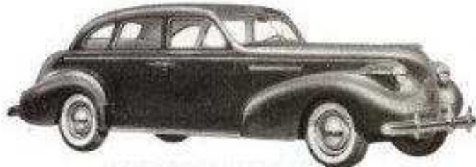
BUICK, Model 61, 1939